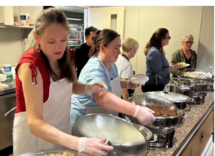
Volunteers serving dinners at the CSHA Festival