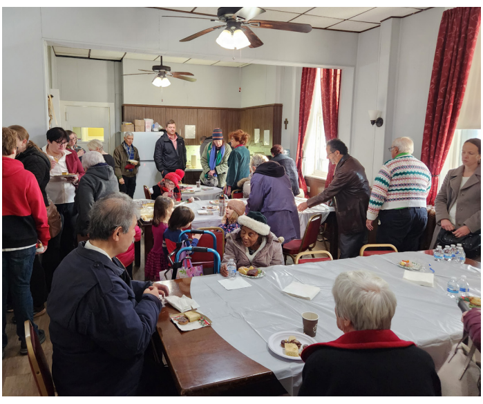
Sharing cookies and good times after the concert and "Mikuláš" visit

The audience included members of the St. Wenceslaus parish and representatives from both American Sokol in Washington and Slavic American Sokol. Following Sv. Mikulas's visit with the children guests enjoyed a reception prepared by CSHA and Church volunteers in the Rectory.