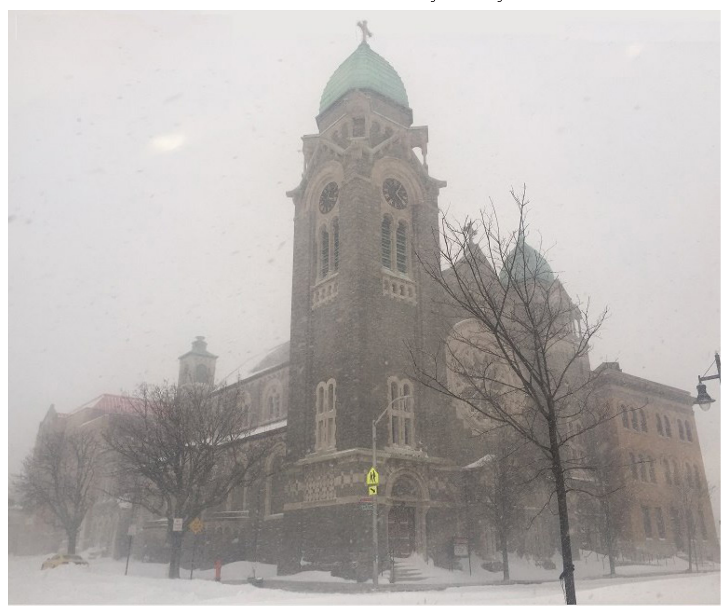
St. Wenceslaus Church in East Baltimore during "Jonas," the blizzard of January 2016