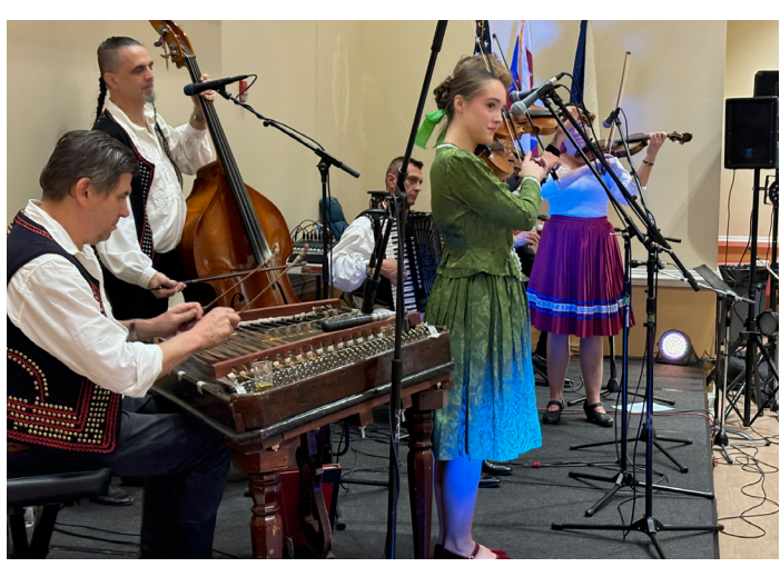
"Pajtaši" - their music is always enjoyed by all

In addition to the program, many of the children enjoyed activities in the art room: coloring, painting and creating little craft projects, including glass painting. Children and some of