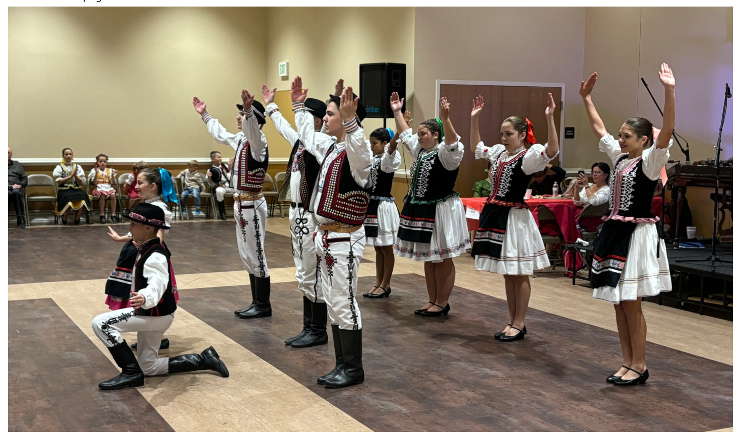
"Limboracik" group from New York performing at CSHA Festival for the first time