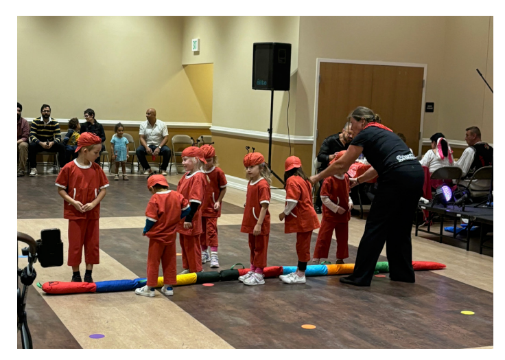
Children from Sokol Washington performing

We hope that all of you attending the festival enjoyed your time there, and we will see everybody at the next one on October 26, 2025, at the Sykesville Legacy Hall.