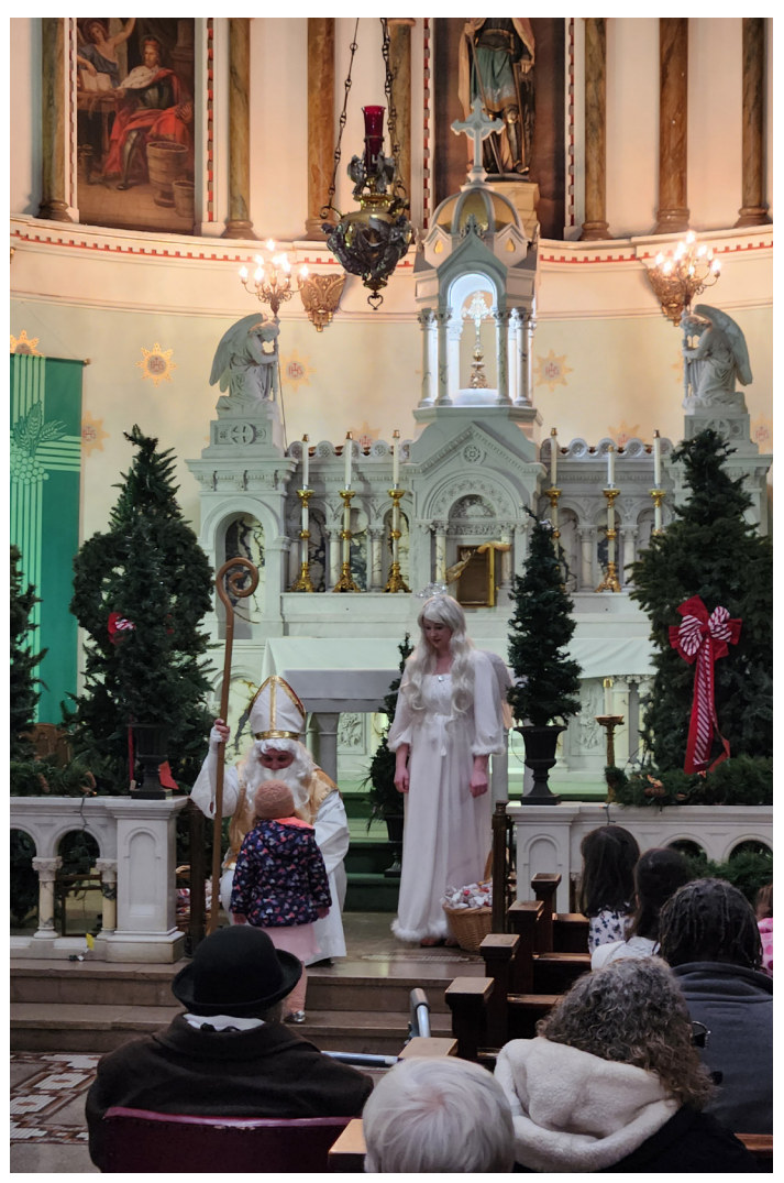
Altar at St. Wenceslaus Church