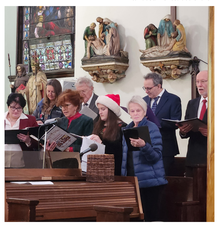
Heritage Singers performing Christmas Carols